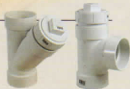
Wye fitting Sanitary tee

It's a good idea to think ahead to the day when the drainpipe becomes clogged with some type of debris. If you use sanitary tees in the corners and add wye fittings in long runs (and mark them or photograph them), you'll be able to blast the system out with a power snake, which saves a lot of digging and pipe replacement.