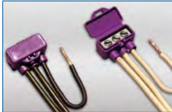
The AlumiConn Connector

CPSC staff recognizes that copper replacement may be cost prohibitive and that the COPALUM repair may be unavailable in a locality. Based upon an evaluation that was, in part, CPSC supported, 5 consumers are advised that, if the COPALUM repair is not available, the AlumiConn connector may be considered the next best alternative for a permanent repair. This repair method involves pigtailing using a setscrew type connector instead of the COPALUM crimp connector in the repaired connections. The AlumiConn connector has performed well in initial tests, but is too new to have developed a significant long-term safe performance history as the COPALUM repair. The repair should be conducted by a qualified electrician because careful, professional workmanship and thoroughness are required to make the AlumiConn connector repair safe and permanent.