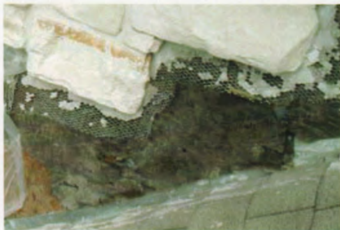
Figure 3. Undersized or omitted diverter — or kickout — flashings allow water to flow beneath the cast-stone facade (above). Window flanges that lap under instead of over building paper can bring rain water into direct contact with the sheathing (right).