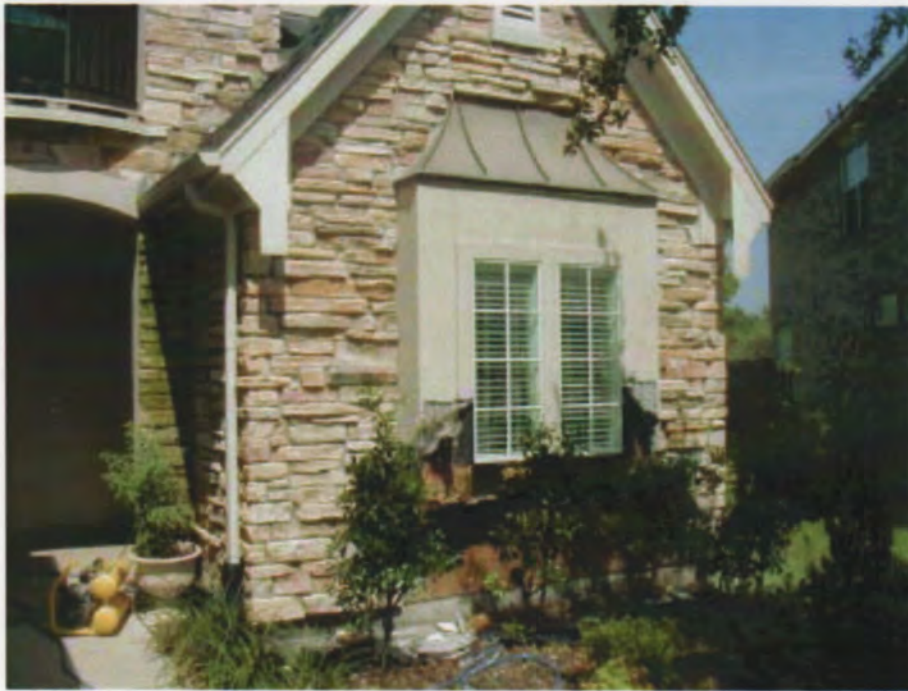
Figure 2. Long, flat “ledgestone” pieces like this create many horizontal shelves where water can stand and soak into grout joints.