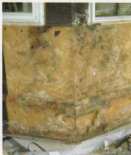
Figure 1. Where stucco (top photos) and cast stone (bottom) have been installed on the same home, the author frequently finds more severe moisture and rot damage under the cast-stone portions of the exterior. One reason is that the stucco terminates at the bottom with a weep screed, while the cast stone sits in a bed of mortar and grout, directly on a foundation ledge, with no weeps or flashings.