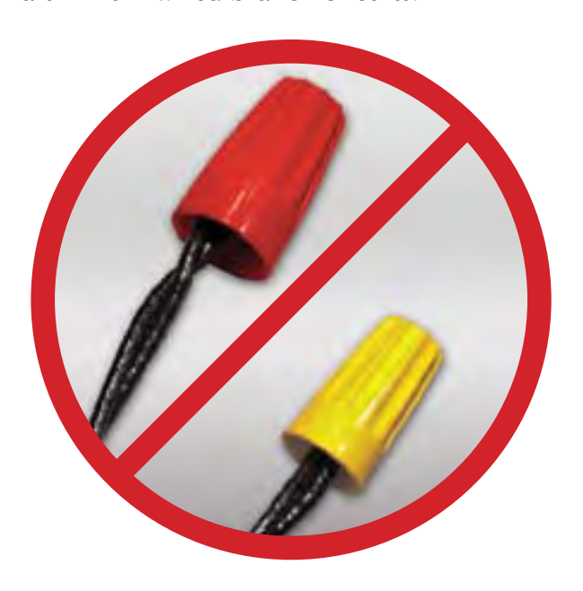
"Pigtailing" with Twist-on Connectors Is Not a Recommended Repair

of twist-on connectors with aluminum wire. It is possible that some pigtailing "repairs" made with twist-on connectors may be prone to even more failures than the original aluminum wire connectors. Accordingly, CPSC staff believes that this method of repair does not solve the problem of overheating present in aluminum-wired branch circuits.