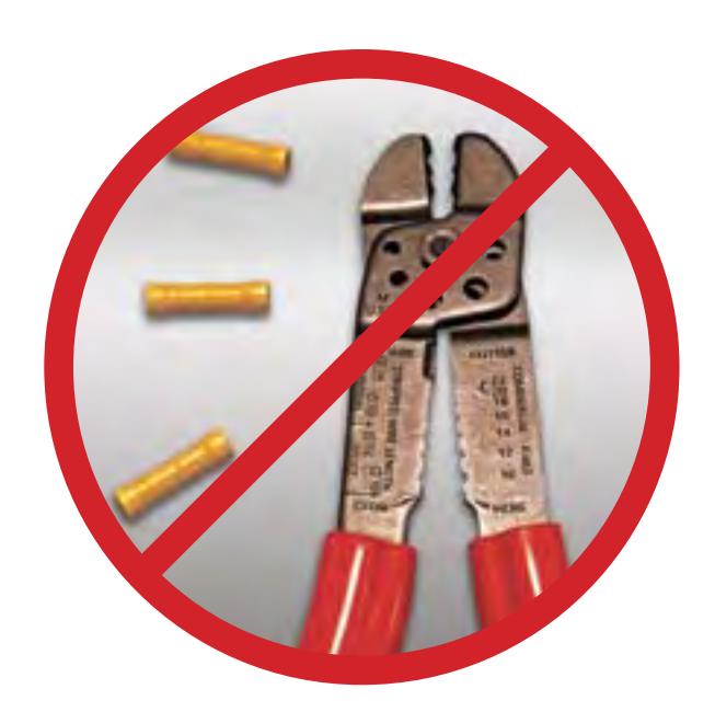
Do Not Use Common Hand-Crimped Connectors with Aluminum Wire

Two other repair methods described below are often recommended by some electricians because they are substantially less expensive than COPALUM crimp connectors. CPSC staff does not consider either of these repairs an acceptable permanent repair.